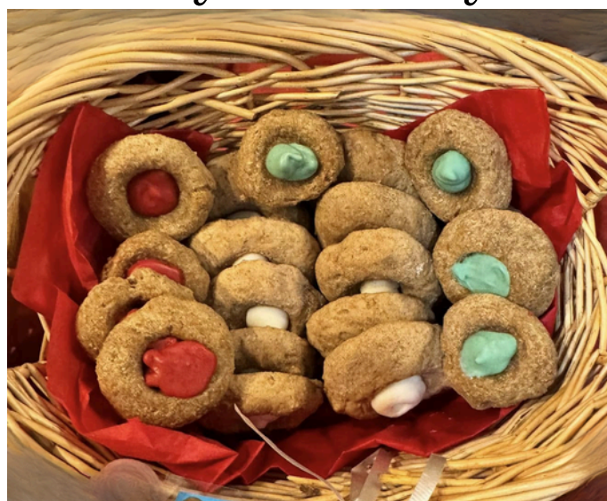
Peanut Butter Drops:

A savory biscuit flavored with bacon, cheddar cheese, garlic, parsley and oregano.