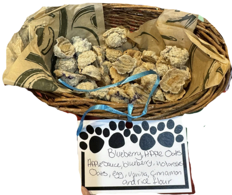
Blueberry, Apple, & Oats:

A peanut butter based cookie with a delicious yogurt center